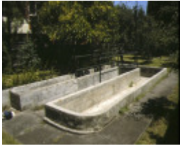
1 sicree family air raid shelter mitford street st kilda elevated view of shelter jan1995