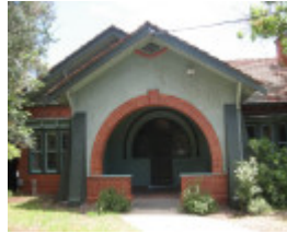
23 Mitford St - front view