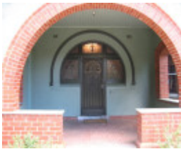
23 Mitford St - entrance porch