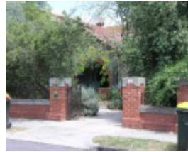
SICREE FAMILY AIR RAID SHELTER SOHE 2008