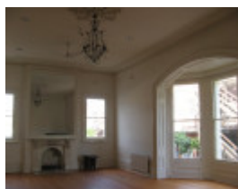
Berkeley Hall_St Kilda_drawing room_KJ_Dec 09