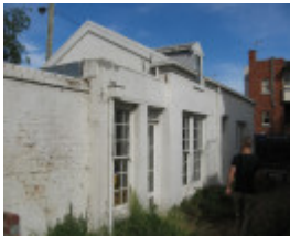
Berkeley Hall_St Kilda_stable_KJ_Dec 09