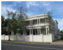
Berkeley Hall_St Kilda_KJ_Dec 09