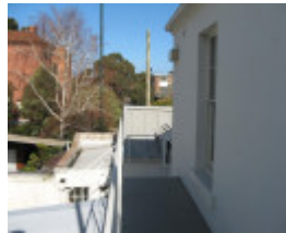
Berkeley Hall_St Kilda_Morwood & Rogers tiles on stable roof_KJ_Dec 09