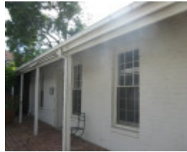
Berkeley Hall_St Kilda_rear servants' quarters_KJ_Dec 09