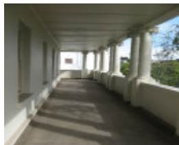
Berkeley Hall_St Kilda_upper colonnade_KJ_Dec 09