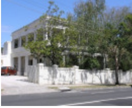
BERKELEY HALL SOHE 2008