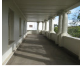
Berkeley Hall_St Kilda_upper colonnade_KJ_Dec 09