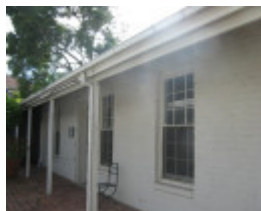
Berkeley Hall_St Kilda_rear servants' quarters_KJ_Dec 09