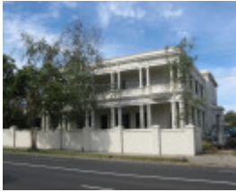
Berkeley Hall_St Kilda_KJ_Dec 09