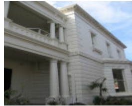
Berkeley Hall_St Kilda_KJ_Dec 09