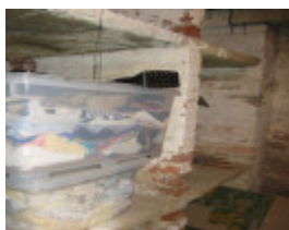
Berkeley Hall_St Kilda_cellar with wine bins_KJ_Dec 09