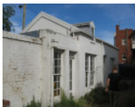
Berkeley Hall_St Kilda_stable_KJ_Dec 09