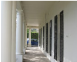
Berkeley Hall_St Kilda_ground floor colonnade_KJ_Dec 09