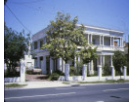
1 berkeley hall princess street st kilda front view