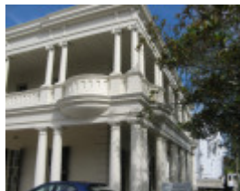
Berkeley Hall_St Kilda_KJ_Dec 09