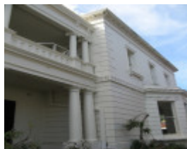
Berkeley Hall_St Kilda_KJ_Dec 09