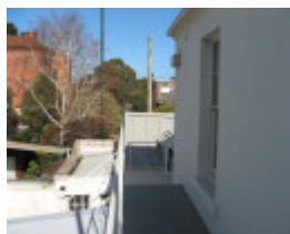
Berkeley Hall_St Kilda_Morwood & Rogers tiles on stable roof_KJ_Dec 09