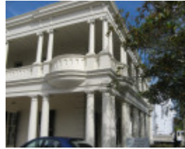
Berkeley Hall_St Kilda_KJ_Dec 09