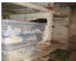
Berkeley Hall_St Kilda_cellar with wine bins_KJ_Dec 09