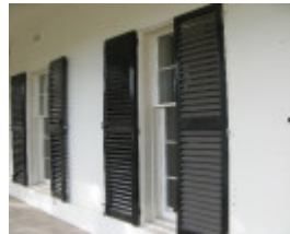
Berkeley Hall_St Kilda_ground floor shutters_KJ_Dec 09