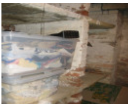
Berkeley Hall_St Kilda_cellar with wine bins_KJ_Dec 09