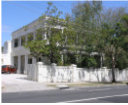
BERKELEY HALL SOHE 2008