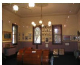
h00675 former gas valve house st kilda road st kilda interior view she project 2004