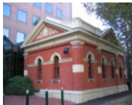
h00675 1 former gas valve house st kilda road st kilda street view she project 2004