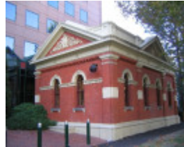
h00675 1 former gas valve house st kilda road st kilda street view she project 2004