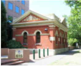
FORMER GAS VALVE HOUSE SOHE 2008