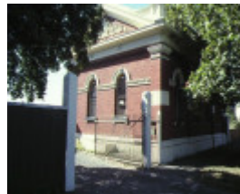
h00675 former gas valve house st kilda road st kilda front gates mar1979