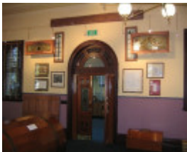
h00675 former gas valve house st kilda road st kilda entrance she project 2004