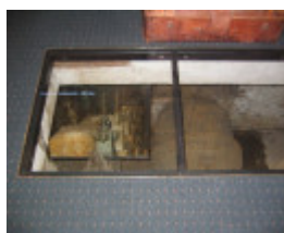
h00675 former gas valve house st kilda road st kilda gas valve she project 2004