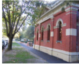
h00675 former gas valve house st kilda road st kilda along street she project 2004