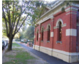
h00675 former gas valve house st kilda road st kilda along street she project 2004