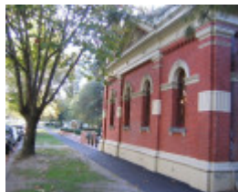
h00675 former gas valve house st kilda road st kilda along street she project 2004