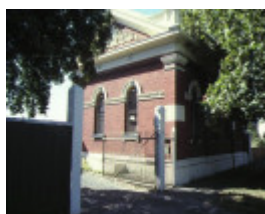
h00675 former gas valve house st kilda road st kilda front gates mar1979