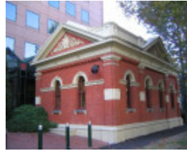
h00675 1 former gas valve house st kilda road st kilda street view she project 2004