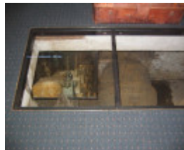
h00675 former gas valve house st kilda road st kilda gas valve she project 2004