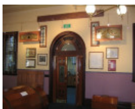
h00675 former gas valve house st kilda road st kilda entrance she project 2004