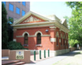
FORMER GAS VALVE HOUSE SOHE 2008