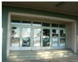
Lorne Cinema detail of entrance 2009