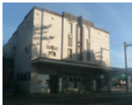
Lorne Cinema front elevation 2009