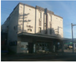
Lorne Cinema front elevation 2009