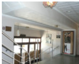
Lorne Cinema detail of foyer 2009