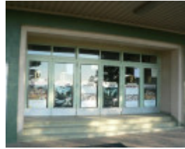
Lorne Cinema detail of entrance 2009