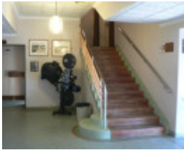
Lorne Cinema detail of foyer and stairs 2009