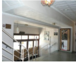
Lorne Cinema detail of foyer 2009