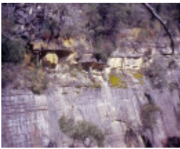
h01556 heatherlie quarry grampians national park halls gapp timber supports she project 2004