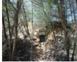
HEATHERLIE (MT DIFFICULT) QUARRY SOHE 2008