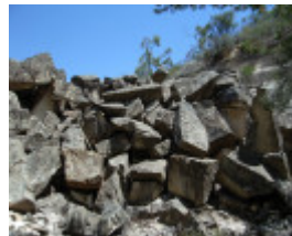
HEATHERLIE (MT DIFFICULT) QUARRY SOHE 2008