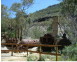
HEATHERLIE (MT DIFFICULT) QUARRY SOHE 2008