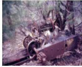
h01556 heatherlie quarry grampians national park halls gapp large jib crane she project 2004