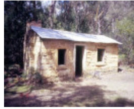
h01556 heatherlie quarry grampians national park halls gapp hut 2 she project 2004