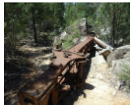
HEATHERLIE (MT DIFFICULT) QUARRY SOHE 2008