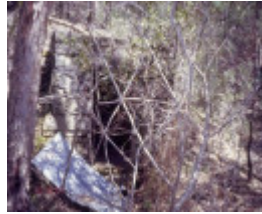
h01556 heatherlie quarry grampians national park halls gapp stone powder magazine she project 2004