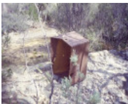
h01556 heatherlie quarry grampians national park halls gapp bailer she project 2004