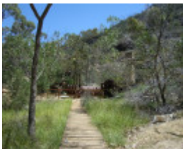
HEATHERLIE (MT DIFFICULT) QUARRY SOHE 2008