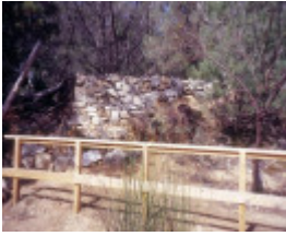
h01556 heatherlie quarry grampians national park halls gapp dry stone wall she project 2004