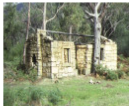
1 heatherlie quarry roses gap stawell building shell