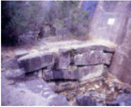
h01556 heatherlie quarry grampians national park halls gapp rock and concrete crane base she project 2004