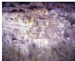
h01556 heatherlie quarry grampians national park halls gapp drilled main rock face she project 2004