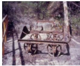
h01556 heatherlie quarry grampians national park halls gapp tramway wagon in sliding she project 2004