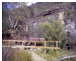
h01556 heatherlie quarry grampians national park halls gapp boilers chimney compressor she project 2004