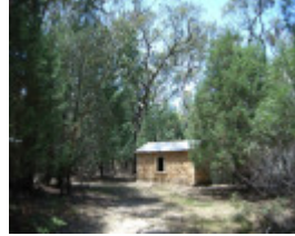
HEATHERLIE (MT DIFFICULT) QUARRY SOHE 2008