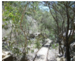
HEATHERLIE (MT DIFFICULT) QUARRY SOHE 2008