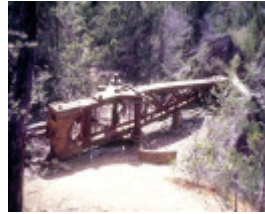
h01556 heatherlie quarry grampians national park halls gapp small jib crane she project 2004