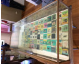
Memorial Hall Koroit all glass advertising slides.JPG