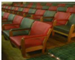
Memorial Hall Koroit detail of dress circle seats 2009