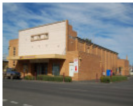
Memorial Hall Koroit front elevation 2009