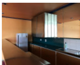
Memorial Hall Koroit Candy Bar detail.JPG