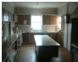
Memorial Hall Koroit kitchen 2009