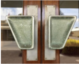
Memorial Hall Koroit nickel plated front door handles.JPG