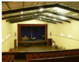
Memorial Hall Koroit interior of auditorium 1 2009