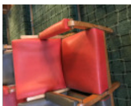
Memorial Hall Koroit dress circle seat and carpet.JPG