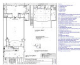
Annotated floor plan.jpg