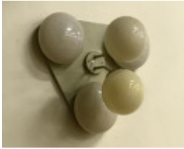
Memorial Hall Koroit light fitting .JPG