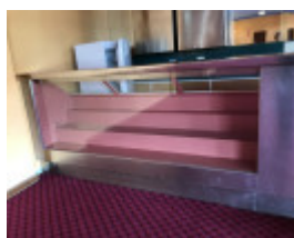
Memorial Hall Koroit Candy Bar front counter.JPG