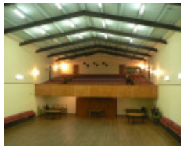
Memorial Hall Koroit interior of auditorium 2 2009