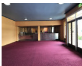
Memorial Hall Koroit Candy Bar.JPG