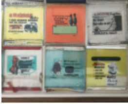
Memorial Hall Koroit advertising slides 3.JPG