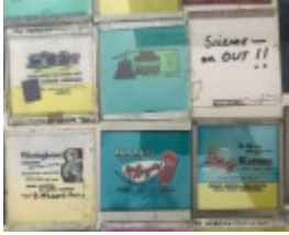
Memorial Hall Koroit advertising slides 2 .JPG