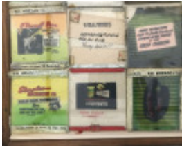
Memorial Hall Koroit advertising slides 1.JPG