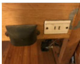
Memorial Hall Koroit Hearing loop and power point dress circle.JPG