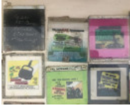
Memorial Hall Koroit advertising slides 4.JPG