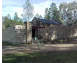
1 powder magazine skidmore road beechworth