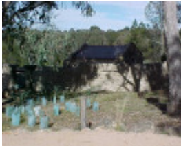
powder magazine skidmore road beechworth