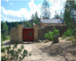
POWDER MAGAZINE SOHE 2008