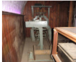
Fuze spinning machine