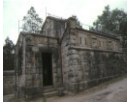
powder magazine skidmore road beechworth entrance