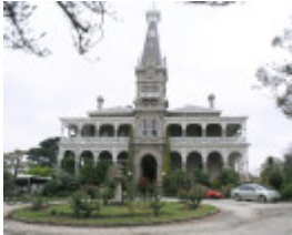
RUPERTSWOOD SOHE 2008