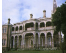
1 rupertswood macedon street sunbury front view detail of lace