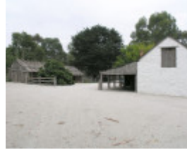
EMU BOTTOM SOHE 2008