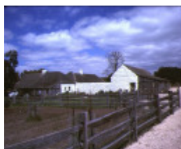
1 emu bottom racecourse road sunbury side view with fencing