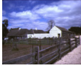
1 emu bottom racecourse road sunbury side view with fencing