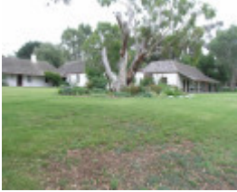
EMU BOTTOM SOHE 2008