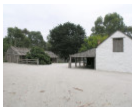
EMU BOTTOM SOHE 2008