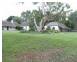
EMU BOTTOM SOHE 2008