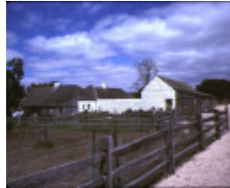
1 emu bottom racecourse road sunbury side view with fencing