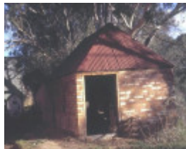
chateau tahblik tabilk rd tabilk blacksmith shop she project 2003