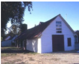
chateau tahblik tabilk rd tabilk cellar entrance she project 2003