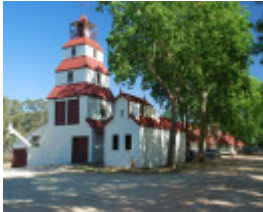
CHATEAU TAHBILK SOHE 2008