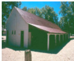
h00296 h296 chateau tahblik workshop