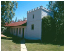
h00296 h296 chateau tahblik winery jan 2004