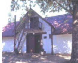
chateau tahblik tabilk rd tabilk winery she project 2003