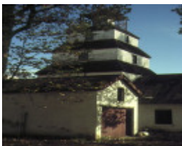
Chateau Tabilk View of Tower.