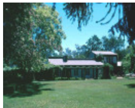
h00296 h296 chateau tahblik house