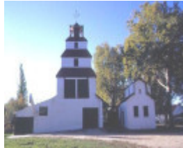
h00296 1 chateau tahblik tabilk rd tabilk tower and still house she project 2003