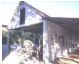
chateau tahblik tabilk rd tabilk cartshed she project 2003