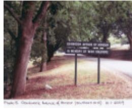
T12133 Quercus robur x canariensis