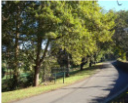
T12133 Quercus robur x canariensis