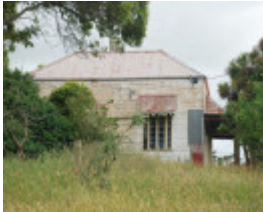
WOODCOT PARK SOHE 2008