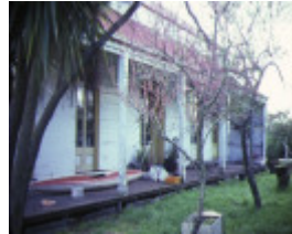
1 woodcot park tannery road tarraville front view oct1984