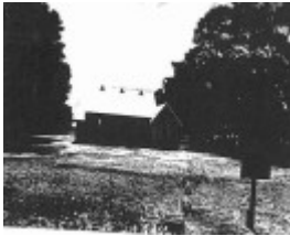
St George's Balliang Anglican Church