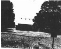
St George's Balliang Anglican Church