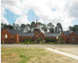
BEECHWORTH PRIMARY SCHOOL NO. 1560 SOHE 2008