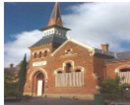
h01718 beechworth primary school junction road beechworth front she project 2004