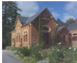
h01718 beechworth primary school junction road beechworth side detail she project 2004