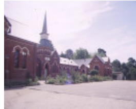
1 beechworth primary school no 1560 junction road beechworth front view mar1998