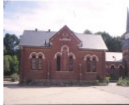
beechworth primary school no 1560 junction road beechworth front detail mar1998