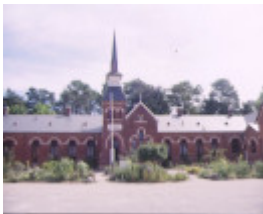
beechworth primary school no 1560 junction road beechworth front elevation mar1998