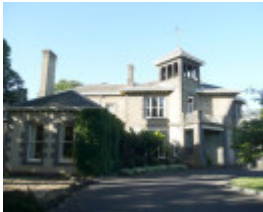
GLENORMISTON HOMESTEAD SOHE 2008