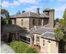
South west corner of the homestead.jpg