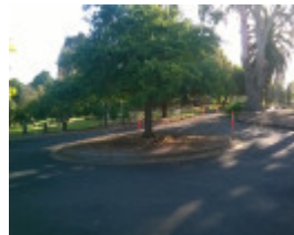
H1611 GLENORMISTON HOMESTEAD LHA 2015 2.jpg