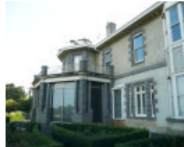
GLENORMISTON HOMESTEAD SOHE 2008