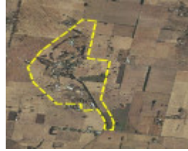
Aerial of Glenormiston Extent.jpg