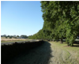
GLENORMISTON HOMESTEAD SOHE 2008