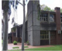
Example of 1970s college building.jpg