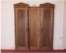
Built-in wardrobe by Prenzel.jpg