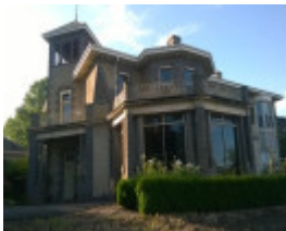
H1611 GLENORMISTON HOMESTEAD LHA 2015 1.jpg