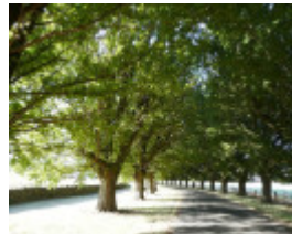
GLENORMISTON HOMESTEAD SOHE 2008