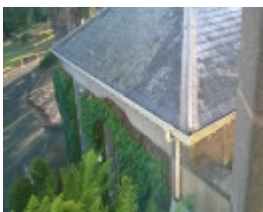
H1611 GLENORMISTON HOMESTEAD LHA 2015 4.jpg