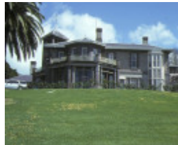
1 glenormiston homestead terang rear elevation