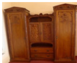
Wardrobe by Prenzel.jpg