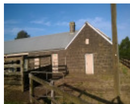
H1611 GLENORMISTON HOMESTEAD LHA 2015 5.jpg