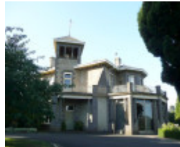
GLENORMISTON HOMESTEAD SOHE 2008