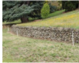
Ha Ha retaining wall.jpg