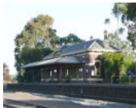
TERANG RAILWAY STATION SOHE 2008