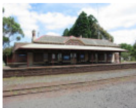
Terang RWS Station Building Platform February 2002