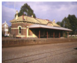
1 terang railway station terang trackside view may 1995