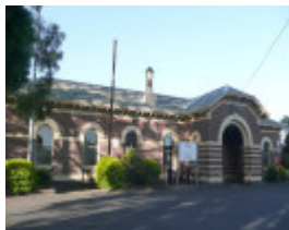
TERANG RAILWAY STATION SOHE 2008