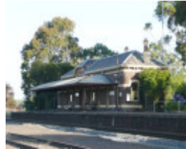
TERANG RAILWAY STATION SOHE 2008