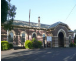
TERANG RAILWAY STATION SOHE 2008