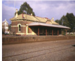
1 terang railway station terang trackside view may 1995