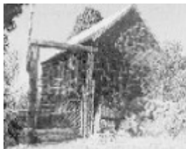
lutheran church gardenia road thomastown entrance publication