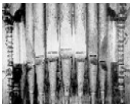
lutheran church gardenia road thomastown pipe organ detail