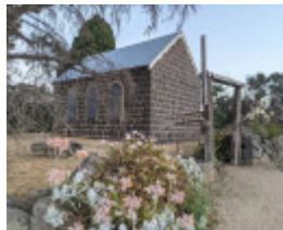
Lutheran Church 2