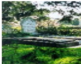
lutheran church gardenia road thomastown cemetery detail publication