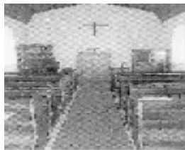
lutheran church gardenia road thomastown interior publication