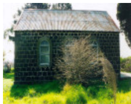
1 lutheran church gardenia road thomastown rear view