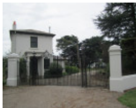
Front entrance showing Gatehouse