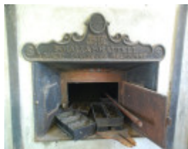
TINTALDRA GENERAL STORE AND FORMER BAKERY SOHE 2008