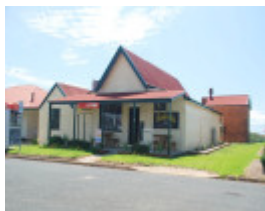
TINTALDRA GENERAL STORE AND FORMER BAKERY SOHE 2008