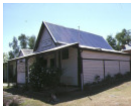
1 tintaldra general store & former bakery main street tintaldra front view may1989