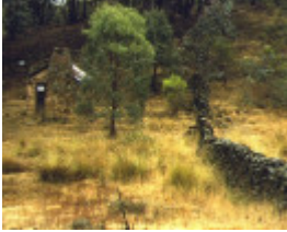
1 herons reef tourist mine wall