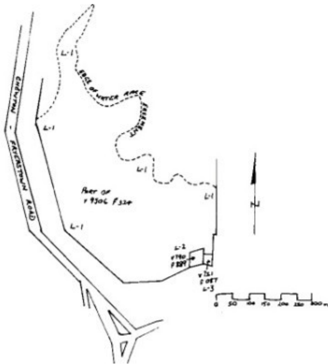
Herons Reef Tourist Mine Plan