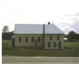
h00544 mechanics institute free library toongabbie front view aug1992