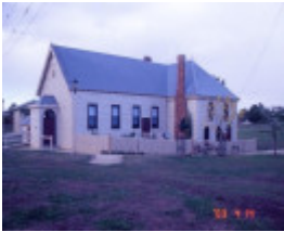
h00544 mechanics institute free library king and cowan street toongabbie south west view she project 2003