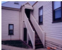
h00544 mechanics institute free library king and cowan street toongabbie exterior stair well she project 2003