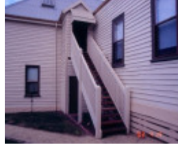
h00544 mechanics institute free library king and cowan street toongabbie exterior stair well she project 2003