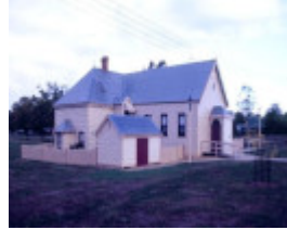
h00544 1 mechanics institute free library king and cowan street toongabbie north west view she project 2003