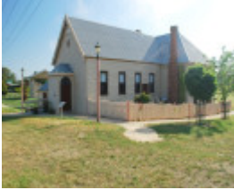
MECHANICS INSTITUTE AND FREE LIBRARY SOHE 2008