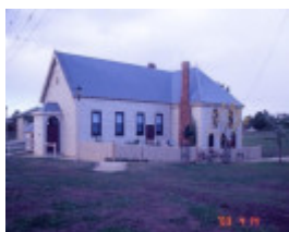
h00544 mechanics institute free library king and cowan street toongabbie south west view she project 2003