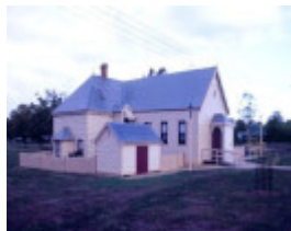
h00544 1 mechanics institute free library king and cowan street toongabbie north west view she project 2003