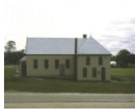
h00544 mechanics institute free library toongabbie front view aug1992