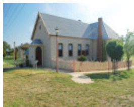
MECHANICS INSTITUTE AND FREE LIBRARY SOHE 2008