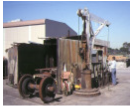
Former Railway Workshops Champion Road Newport Hydraulic Crane