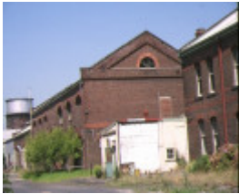
Former Railway Workshops Champion Road Newport Central Store Feb 1994