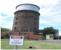
FORMER NEWPORT RAILWAY WORKSHOPS SOHE 2008