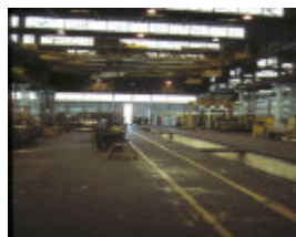
Former Railway Workshops Champion Road Newport Workshop Interior