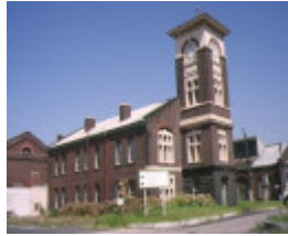
Former Railway Workshops Champion Road Newport Central Offices & Clock Tower