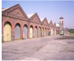
1 former railway workshops champion road newport east block of workshops feb1994