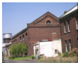
Former Railway Workshops Champion Road Newport Central Store Feb 1994