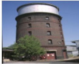
Former Railway Workshops Champion Road Newport Water Tower Feb 1994