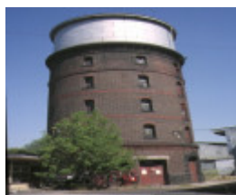
Former Railway Workshops Champion Road Newport Water Tower Feb 1994