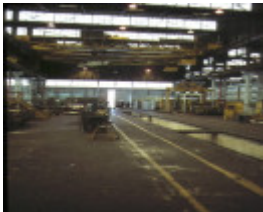
Former Railway Workshops Champion Road Newport Workshop Interior