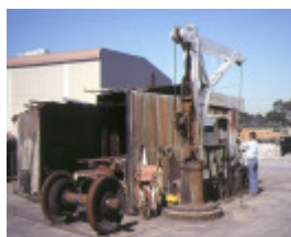
Former Railway Workshops Champion Road Newport Hydraulic Crane