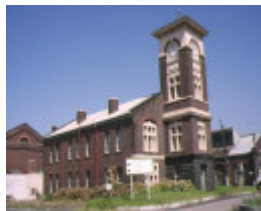
Former Railway Workshops Champion Road Newport Central Offices & Clock Tower