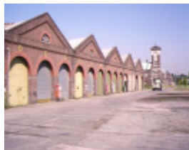
1 former railway workshops champion road newport east block of workshops feb1994