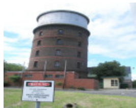
FORMER NEWPORT RAILWAY WORKSHOPS SOHE 2008