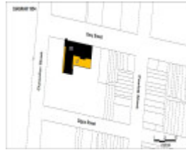
Mercy Hospital East Melbourne Plan HV Nov 2009.jpg