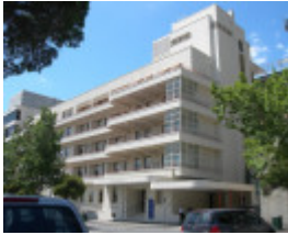
MERCY HOSPITAL SOHE 2008