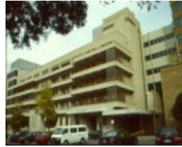
1mercy hospital may01