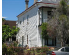
ARUNDEL SOHE 2008