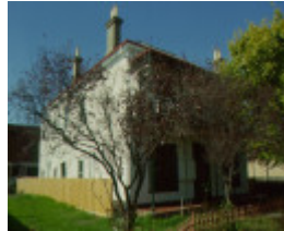
1 arundel ross street coburg front 2001