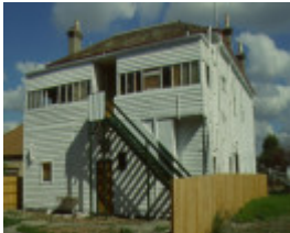
Arundel Ross Street Coburg Rear 2001