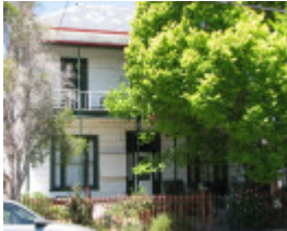
ARUNDEL SOHE 2008