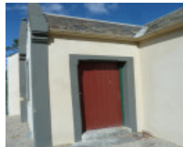
H1947 OVERNEWTON GATEHOUSE LHA 2015 3.JPG