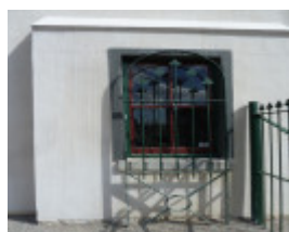
H1947 OVERNEWTON GATEHOUSE LHA 2015 2.JPG