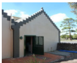
H1947 OVERNEWTON GATEHOUSE LHA 2015 1.JPG