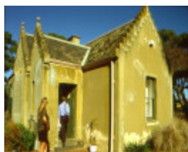
1 overnewton gatehouse h1947 march 2001