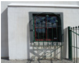
H1947 OVERNEWTON GATEHOUSE LHA 2015 2.JPG