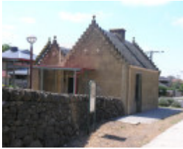
OVERNEWTON GATEHOUSE SOHE 2008