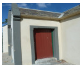
H1947 OVERNEWTON GATEHOUSE LHA 2015 3.JPG