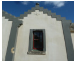
H1947 OVERNEWTON GATEHOUSE LHA 2015 4.JPG