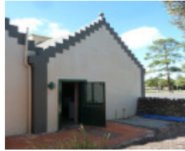
H1947 OVERNEWTON GATEHOUSE LHA 2015 1.JPG