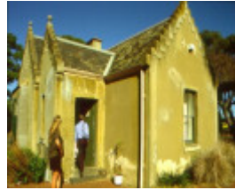
1 overnewton gatehouse h1947 march 2001