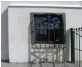
H1947 OVERNEWTON GATEHOUSE LHA 2015 2.JPG