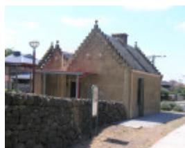
OVERNEWTON GATEHOUSE SOHE 2008