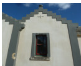
H1947 OVERNEWTON GATEHOUSE LHA 2015 4.JPG