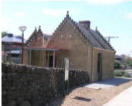
OVERNEWTON GATEHOUSE SOHE 2008