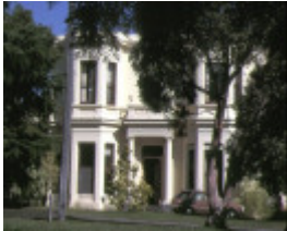
1 greenwich house irving road toorak front view