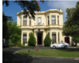
Main facade to Irving Road