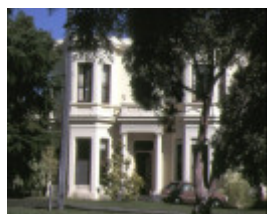
1 greenwich house irving road toorak front view