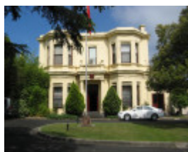
Main facade to Irving Road