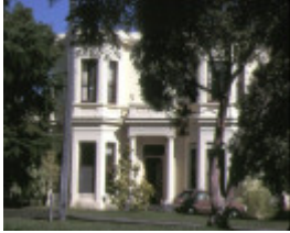
1 greenwich house irving road toorak front view