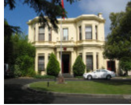
Main facade to Irving Road