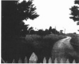
House, Geelong-Bacchus Marsh Road