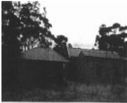
Former School & Mechanics Institute