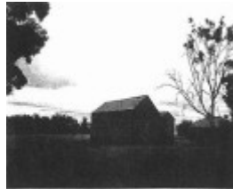
Former School & Mechanics Institute