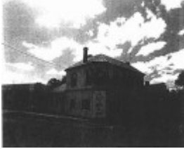
Stoney's Bridge Inn Hotel