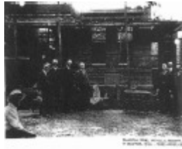
Bacchus Marsh Secondary College. Maddingley Campus