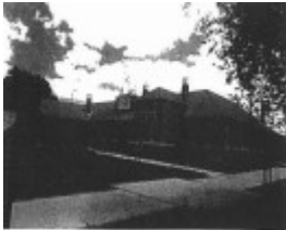
Bacchus Marsh Secondary College. Maddingley Campus