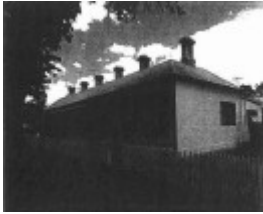
13-17 Franklin Street, Houses