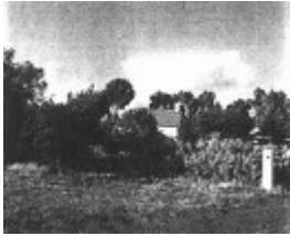
House, Browns Lane