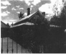
Cowan Cottage (no. 20).