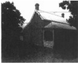
Webster Brothers yard & former "The Iron Church"