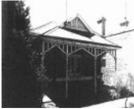
House, 48A Grant Street