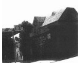
Police residence, 121 Main Street