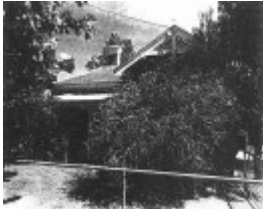
Police residence, 121 Main Street