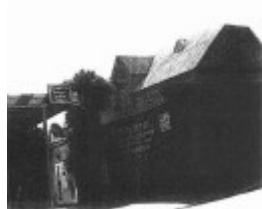
Police residence, 121 Main Street