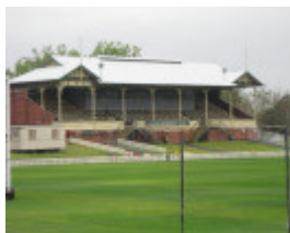
St Kilda Cricket Ground_Blackie Ironmonger Stand_KJ_Oct 09