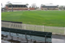
St Kilda Cricket Ground_KJ_Oct 09