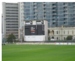
St Kilda Cricket Ground_scoreboard_KJ_Oct 09