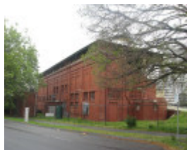
St Kilda Cricket Ground_Blackie Ironmonger rear_KJ_Oct 09