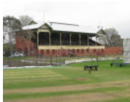
St Kilda Cricket Ground_Murray Stand_KJ_Oct 09