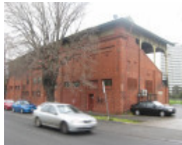
St Kilda Cricket Ground_Murray Stand rear view_KJ_Oct 09