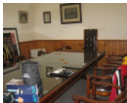
St Kilda Cricket Ground_Committee room_KJ_Oct 09