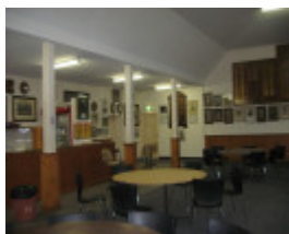
St Kilda Cricket Ground_members' bar_KJ_Oct 09