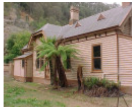
H00583 walhalla po exterior side mar 2003