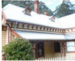
After Photograph - Reference F3834 2016