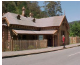
H00583 1 walhalla po exterior mar 2003