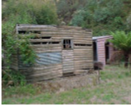
Walhalla Post Office Exterior Outbuildings March 2003