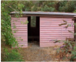
Walhalla Post Office Exterior Outbuilding March 2003