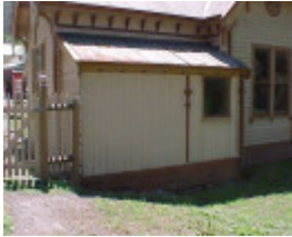
Walhalla Post Office Exterior March 2003