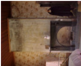
Walhalla Post Office Interior Wallpapers March 2003