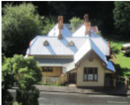
After Photograph - Reference F3834 2016