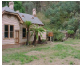
H00583 walhalla po exterior7 mar 2003