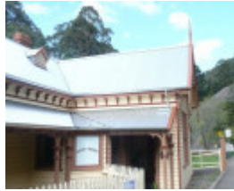
After Photograph - Reference F3834 2016