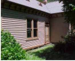
Walhalla Post Office Exterior Side March 2003