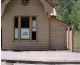
Walhalla Post Office Exterior March 2003