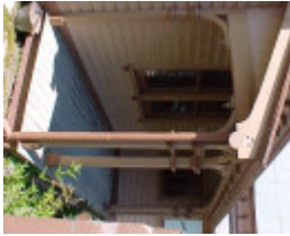
Walhalla Post Office Exterior Verandah March 2003