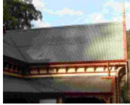
Before Photograph - Reference F3834 2014