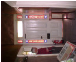
Walhalla Post Office Interior March 2003