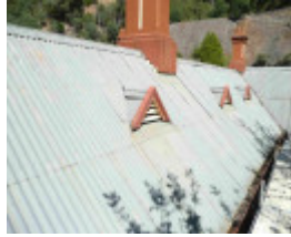
Before Photograph - Reference F3834 2014