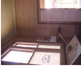
Walhalla Post Office Interior March 2003