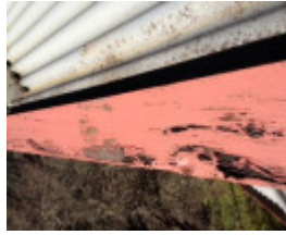
Before Photograph - Reference F3834 2014