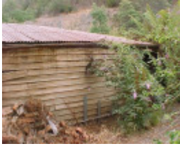
Walhalla Post Office Exterior Outbuilding March 2003