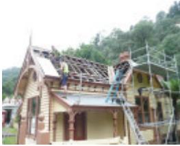
During Photograph - Reference F3834 2015