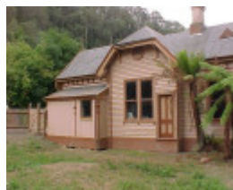
H00583 walhalla po exterior3 mar 2003