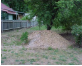
Walhalla Post Office Exterior Rear Mound March 2003