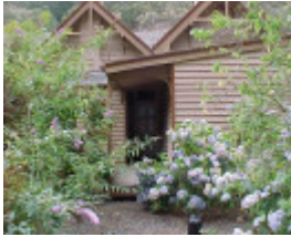
Walhalla Post Office Exterior Twin Gables March 2003