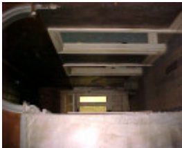
Walhalla Post Office Interior Hallway March 2003