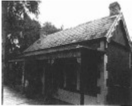
house, 10 Gisbourne Road