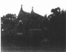
St Bernards Parish Primary School.