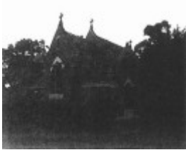
St Bernards Parish Primary School.