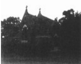
St Bernards Parish Primary School.