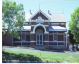
1 ovens & murray hospital for the aged warners road beechworth front view