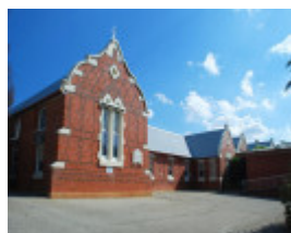
OVENS AND MURRAY HOSPITAL FOR THE AGED SOHE 2008