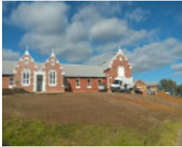
Main facade in July 2018