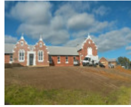
Main facade in July 2018