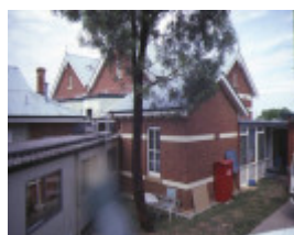
ovens & murray hospital for the aged warners road beechworth rear view dec1984