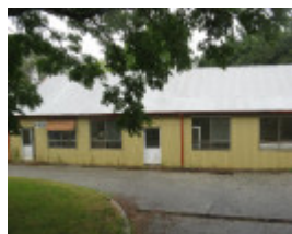
Recreation wing east side