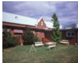
ovens & murray hospital for the aged warners road beechworth side elevation dec1984