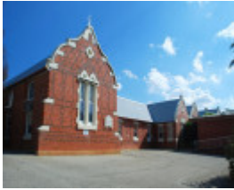
OVENS AND MURRAY HOSPITAL FOR THE AGED SOHE 2008