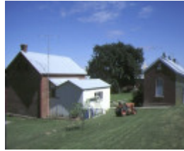
ovens & murray hospital for the aged warners road beechworth rear building