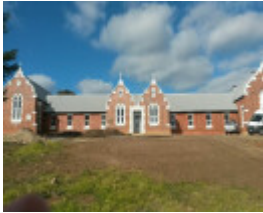
Main facade in July 2018