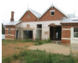
Wallace Ward rear