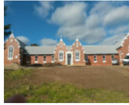
Main facade in July 2018