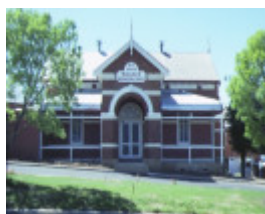
1 ovens & murray hospital for the aged warners road beechworth front view