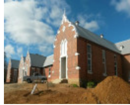
Main facade in July 2018