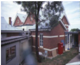
ovens & murray hospital for the aged warners road beechworth rear view dec1984