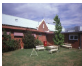
ovens & murray hospital for the aged warners road beechworth side elevation dec1984