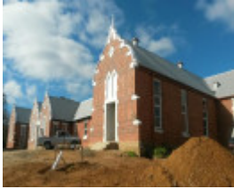
Main facade in July 2018