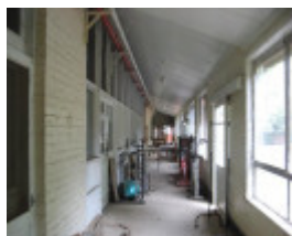
Recreation wing corridor