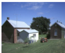
ovens & murray hospital for the aged warners road beechworth rear building