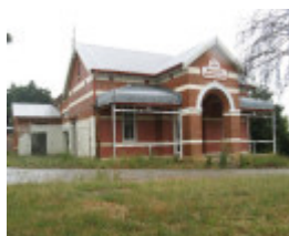
Wallace Ward front