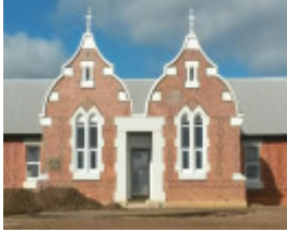
Main facade in July 2018