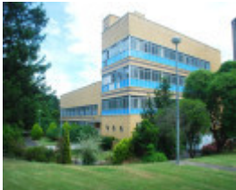
SANITARIUM HEALTH FOOD COMPANY AND SIGNS PUBLISHING COMPANY SOHE 2008