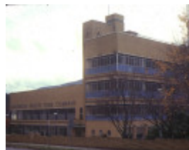
1 sanitarium health food company & signs front view jun1981