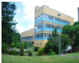
SANITARIUM HEALTH FOOD COMPANY AND SIGNS PUBLISHING COMPANY SOHE 2008