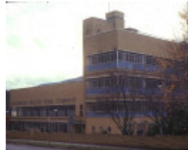
1 sanitarium health food company & signs front view jun1981