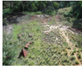
CASSILIS GOLD MINING COMPANY TREATMENT WORKS SOHE 2008