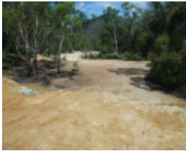
CASSILIS GOLD MINING COMPANY TREATMENT WORKS SOHE 2008