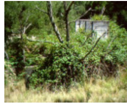
1 cassilis gold treatment works substation db