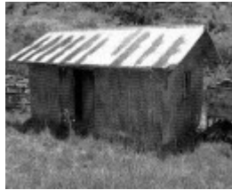
HO200 - Hill, later Birch farm complex - Standard design diary erected in 1935