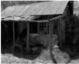
HO200 - Hill, later Birch farm complex - cottage from street