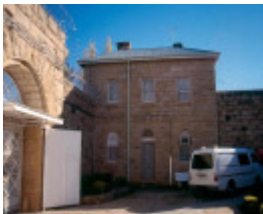
h01549 h m prison william street beechworth gaolers quarters and entry yard june2004