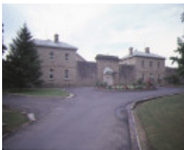
1 h m prison william street beechworth front view dec1984