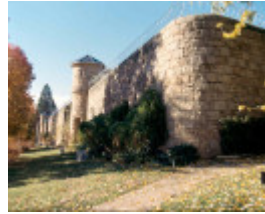
h01549 h m prison william street beechworth south west corner june2004