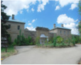
HM PRISON BEECHWORTH SOHE 2008