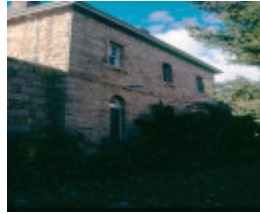
h01549 h m prison william street beechworth exterior gaolers quarters june2004