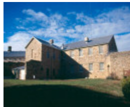
h01549 h m prison william street beechworth exterior kitchen and office wing june2004