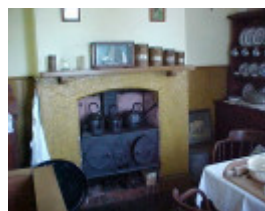
h01520 lady bay lighthouse complex kitchen jun04 pm1