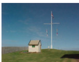
h01520 lady bay lighthouse complex flagstaff jun04 pm1