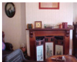
h01520 lady bay lighthouse complex living room jun04 pm1