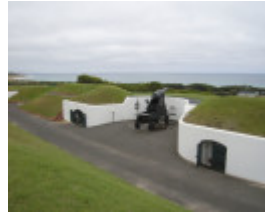
LADY BAY LIGHTHOUSE COMPLEX SOHE 2008