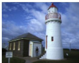
h01520 lady bay lighthouse store flagstaff hill warrnambool rear view of lighthouse may1984