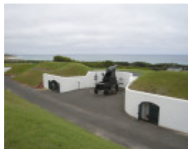
LADY BAY LIGHTHOUSE COMPLEX SOHE 2008