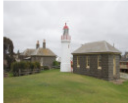
LADY BAY LIGHTHOUSE COMPLEX SOHE 2008