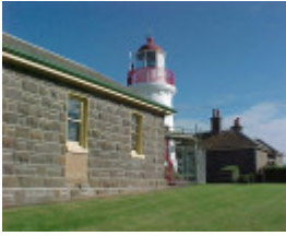
h01520 1 lady bay lighthouse complex chartroom jun04 pm1