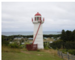
LADY BAY LIGHTHOUSE COMPLEX SOHE 2008