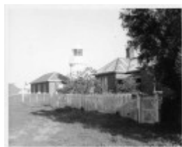
h01520 lady bay lighthouse complex 1962