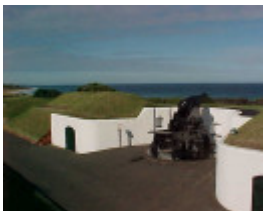
h01520 lady bay lighthouse complex battery jun04 pm1