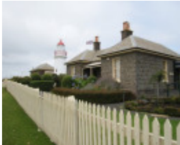
LADY BAY LIGHTHOUSE COMPLEX SOHE 2008