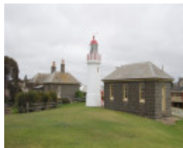
LADY BAY LIGHTHOUSE COMPLEX SOHE 2008