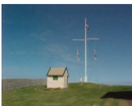
h01520 lady bay lighthouse complex flagstaff jun04 pm1