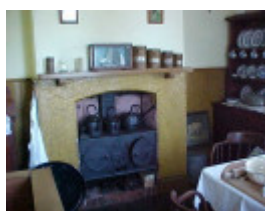
h01520 lady bay lighthouse complex kitchen jun04 pm1