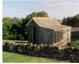
h01520 lady bay lighthouse complex privy jun04 pm1