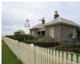
LADY BAY LIGHTHOUSE COMPLEX SOHE 2008