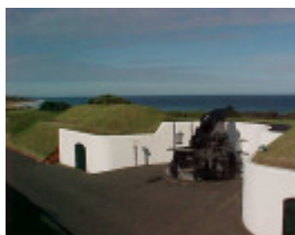
h01520 lady bay lighthouse complex battery jun04 pm1