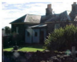
h01520 lady bay lighthouse complex cottage jun04 pm1