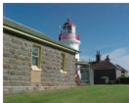
h01520 1 lady bay lighthouse complex chartroom jun04 pm1