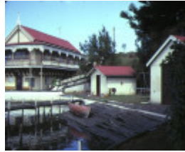
1 proudfoot's boathouse simpson street warrnambool view of property mar1985