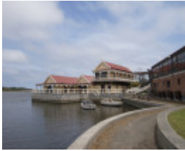
PROUDFOOT'S BOATHOUSE SOHE 2008