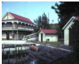
1 proudfoot's boathouse simpson street warrnambool view of property mar1985