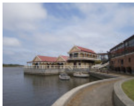
PROUDFOOT'S BOATHOUSE SOHE 2008