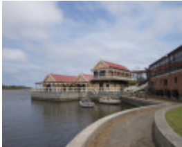
PROUDFOOT'S BOATHOUSE SOHE 2008