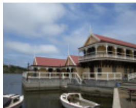
PROUDFOOT'S BOATHOUSE SOHE 2008