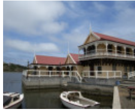
PROUDFOOT'S BOATHOUSE SOHE 2008