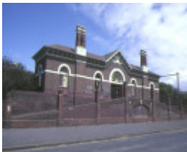
former albert park railway station complex ferrars street albert park front elevation nov1986