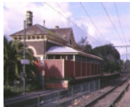
former albert park railway station complex ferrars street albert park platform side jun1998