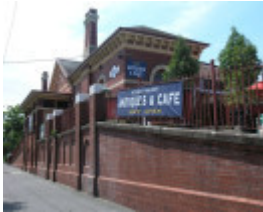
ALBERT PARK RAILWAY STATION COMPLEX SOHE 2008