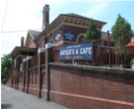
ALBERT PARK RAILWAY STATION COMPLEX SOHE 2008