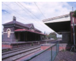
former albert park railway station complex ferrars street albert park platform view feb1989