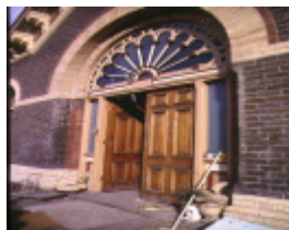
former albert park railway station complex ferrars street albert park front entrance jun1998