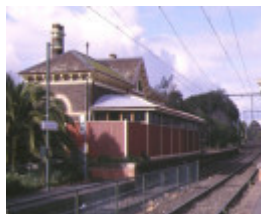
former albert park railway station complex ferrars street albert park platform side jun1998