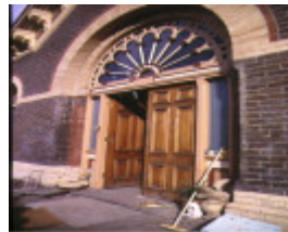
former albert park railway station complex ferrars street albert park front entrance jun1998