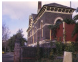
1 former albert park railway station complex ferrars street albert park front elevation jun1998