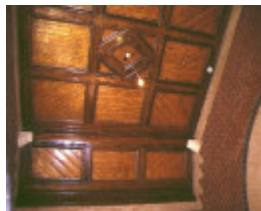
former albert park railway station complex ferrars street albert park ceiling detail jun1998