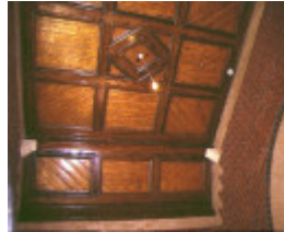
former albert park railway station complex ferrars street albert park ceiling detail jun1998