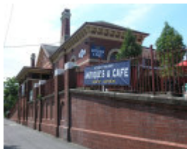
ALBERT PARK RAILWAY STATION COMPLEX SOHE 2008