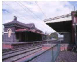
former albert park railway station complex ferrars street albert park platform view feb1989