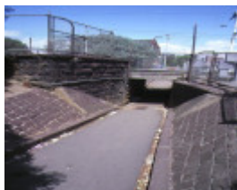
former albert park railway station complex ferrars street albert park underpass nov1986