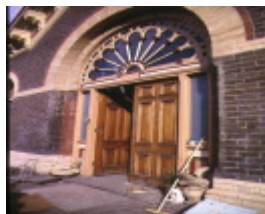
former albert park railway station complex ferrars street albert park front entrance jun1998