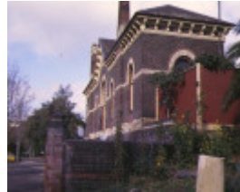
1 former albert park railway station complex ferrars street albert park front elevation jun1998