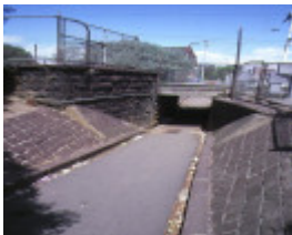
former albert park railway station complex ferrars street albert park underpass nov1986