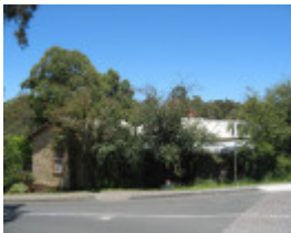
Southernwood_Eltham_house from north-west_KJ_Dec 09