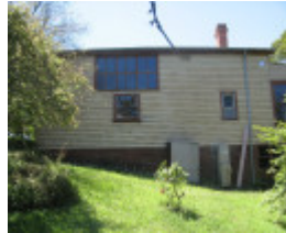
Southernwood_Eltham_south of house with studio windows_KJ_Dec 09