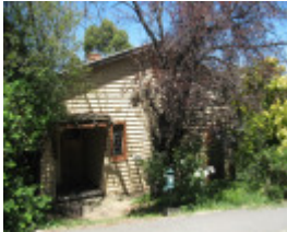
Southernwood_Eltham_entrance view_KJ_Dec 09