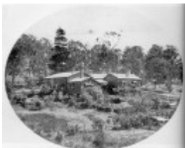
Southernwood rear view