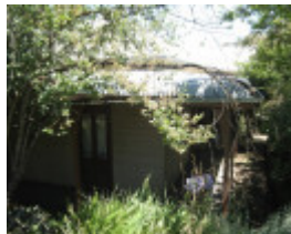
Southernwood_Eltham_return verandah_KJ_Dec 09