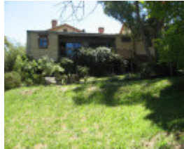
Southernwood_Eltham_rear view_KJ_Dec 09