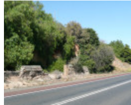
LIME-BURNING KILN SOHE 2008