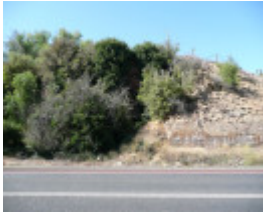
LIME-BURNING KILN SOHE 2008