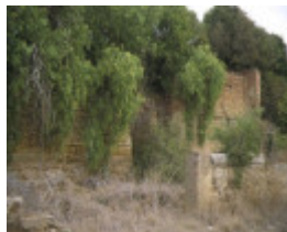
1 lime burning kiln waurn ponds front view apr1997