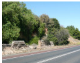
LIME-BURNING KILN SOHE 2008