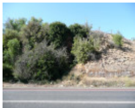
LIME-BURNING KILN SOHE 2008