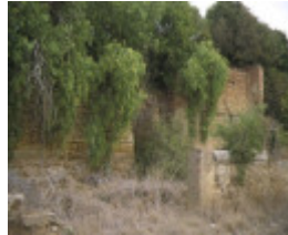
1 lime burning kiln waurn ponds front view apr1997